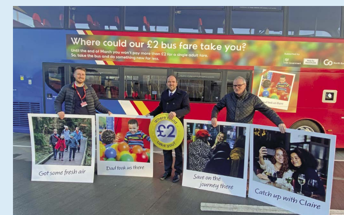
Buses Minister, Richard Holden at Go North East's Gateshead depot to launch the scheme. More than 130 bus operators are taking part in the offer, which applies on over 4,600 routes.

The government has estimated that the average single fare for a 3-mile journey is £2.80, meaning the special fare will save passengers almost 30%. The initiative, which ends on March 31st, will help millions of Go-Ahead passengers with travel costs for work, education, and essential journeys.