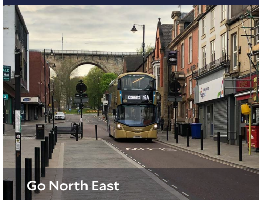
Go North East

The transport industry is playing a critical role during the Coronavirus outbreak by helping key workers to access hospitals, care homes, supermarkets and places of work. Our buses and trains are still in service whilst the public followed the government guidance to stay at home.