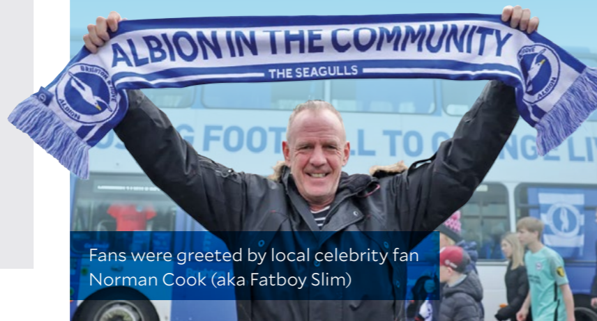
Fans were greeted by local celebrity fan Norman Cook (aka Fatboy Slim)

Brighton & Hove Buses was delighted to support their Community Matchday providing our Albion in The Community-branded bus at the AMEX football stadium. In total, fans raised an amazing £20,000 on the day, which will all go towards the charity's award-winning work across Sussex.