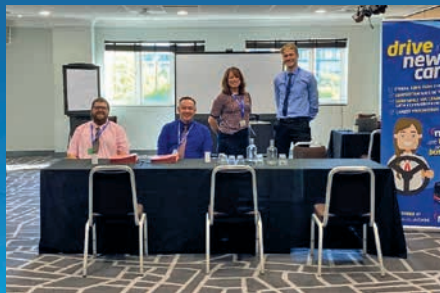
MoreBus recruitment event at Bournemouth's Village Hall

"The reaction from the local community has been fantastic. We even got sent a model bus full of goodies from staff at a local branch of Tesco to thank us for getting them to work."